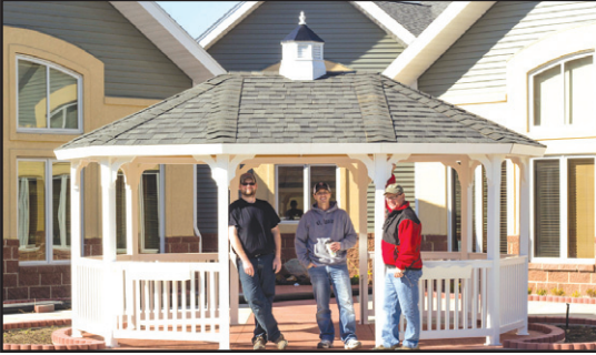
The club recently built a gazebo and completed the memorial garden at the Knife River Care Center.