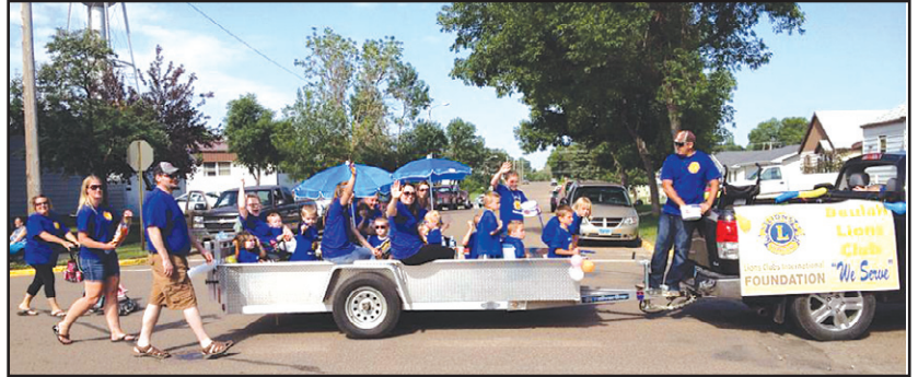
Volunteers for various events for town centennials and country fairs.