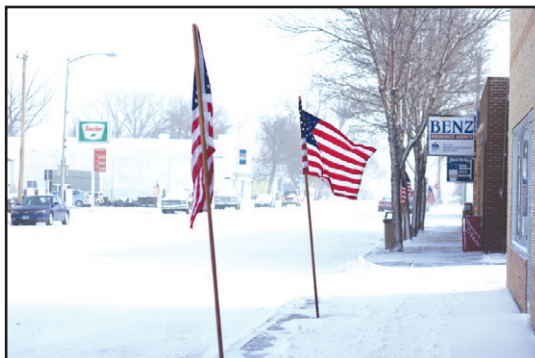
Five times a year American flags are displayed throughout the community.