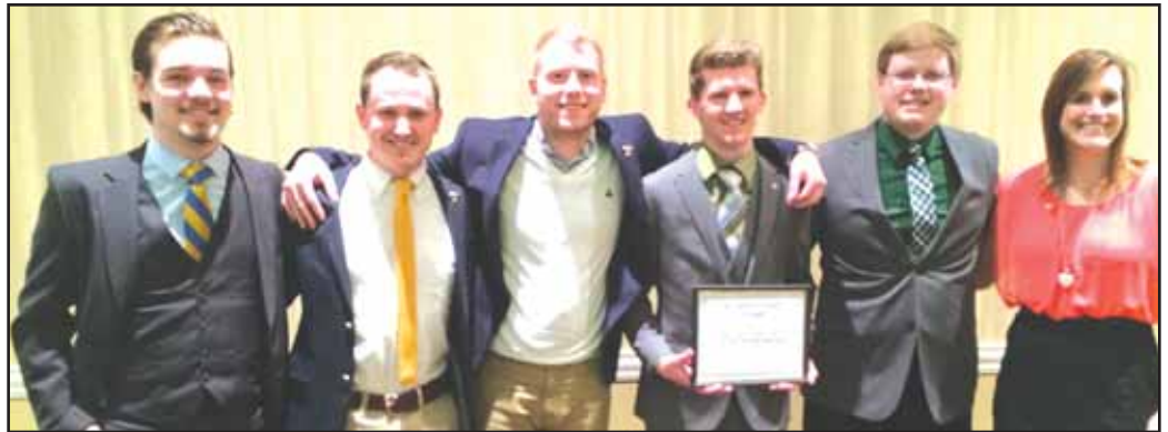
A photo of the group after receiving the award.

currently club secretary, was voted by the club as the 2015