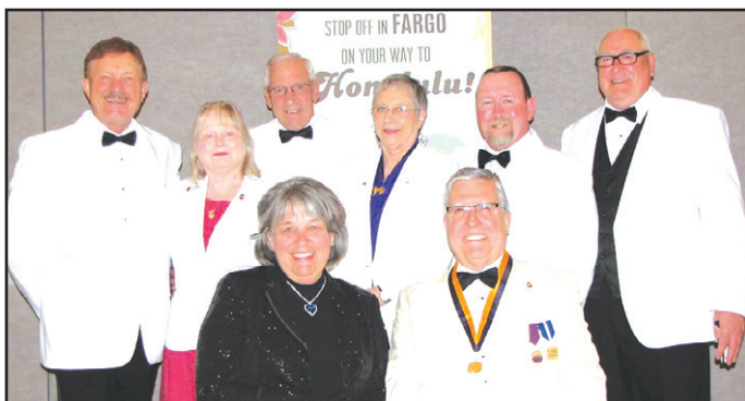
MD5 2014-2015 DG's