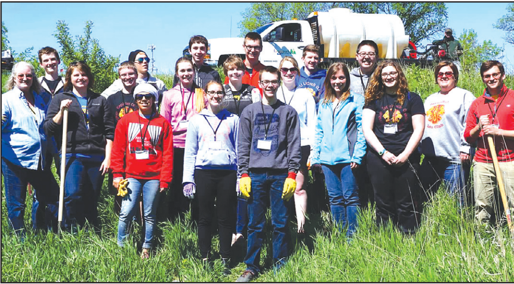
Leos planting trees