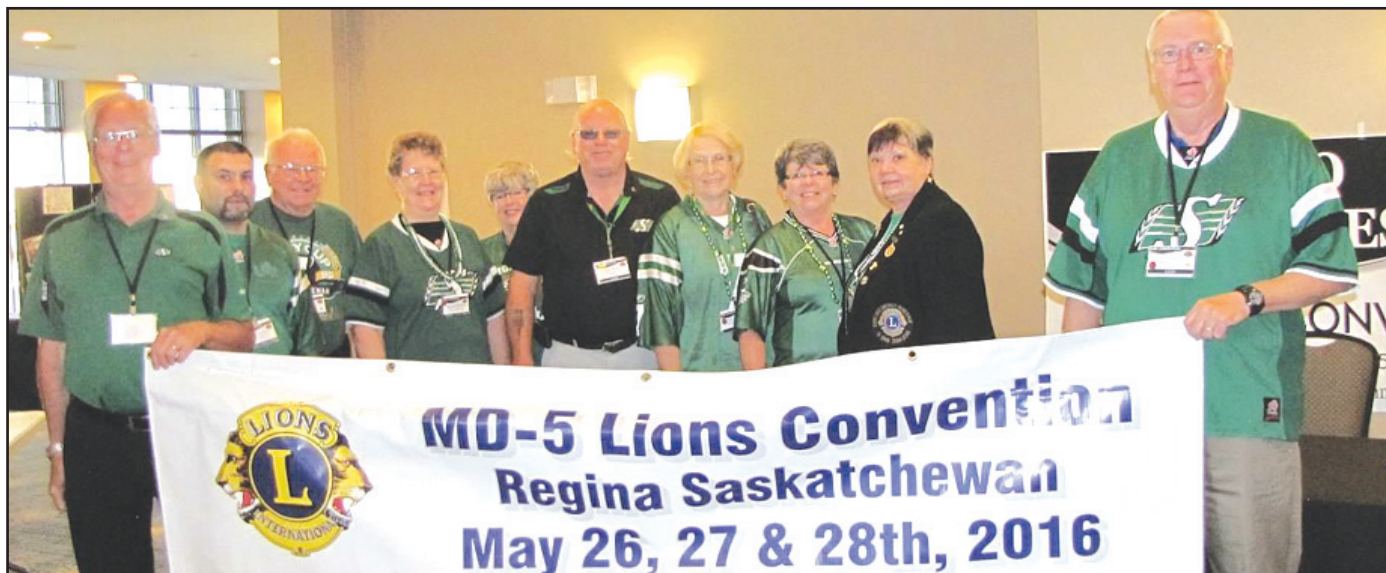
Regina Convention 2016