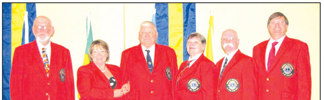
MD5 2015-2016 DG's