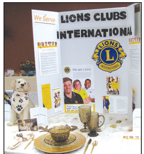
Tables 4 Vision.

Without working together this event would not have been a success. Fourteen ladies from Napoleon and surrounding communities participated this year with one or more displays. Encouraging words