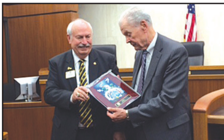
VP Corlew presents LCI Peace Poster plaque to ND Chief Justice VanDeWalle in the Supreme Court room at the ND Capitol.