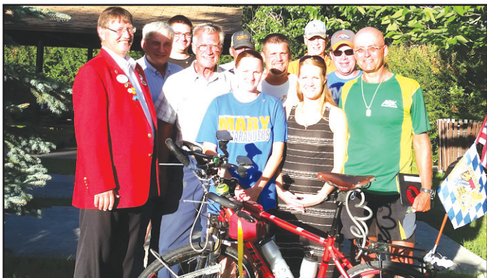
Bike riders from Germany.