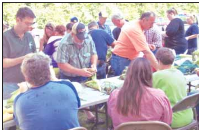
Lions members and some community members joined to husk corn.

Sight 4 Kidz was discussed and a screening was planned to be complemented in the Emerado School in October.