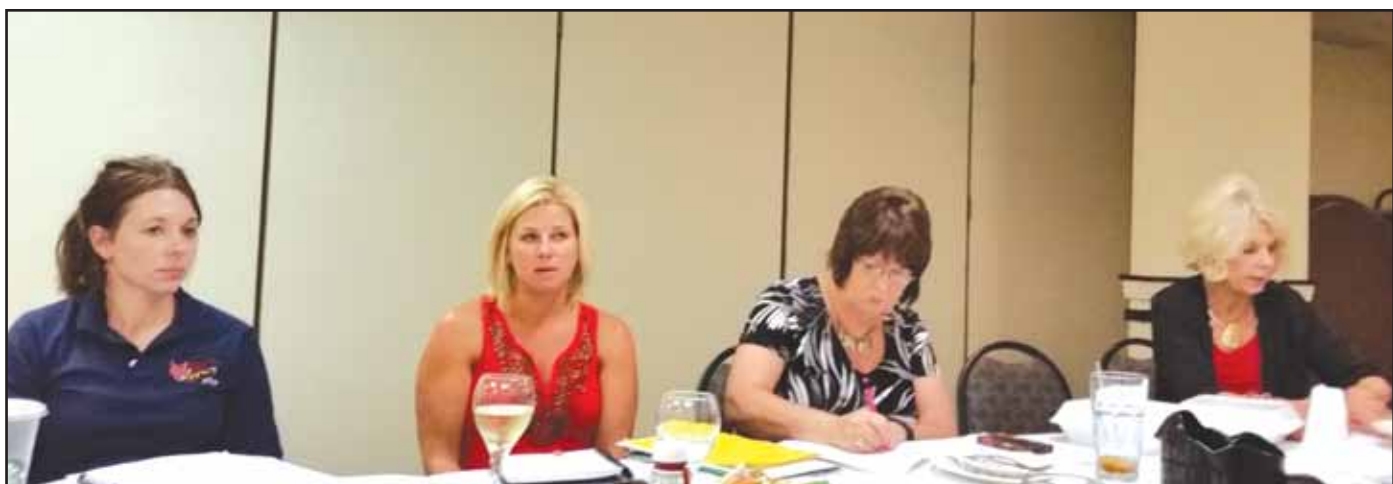
Members of the convention planning committee hard at work.

have tried to figure out what I love so much about Lions and it is all the good we do. Yes, I love to make a difference in someone's life. I love to serve in our community, making our community an even sweeter place to live. And then it is fun to go to Lions projects and help with other Lion's work together. And here is what this enjoyment is. It is the people. Those we serve and those we serve with. Other Lions. Like thinking people. You see I am convinced to be a Lion you are a very unselfish person. To be a Lion you have unthinkingly become a gift to others. And the beauty of this act is that who you best spend your time with those like people. Fellow Lions. So you go to the convention and who is there but the best people, Lions. Now they all greet you like long lost relatives. I have also observed that Lions like to have a good time. And so the Convention continued on next page