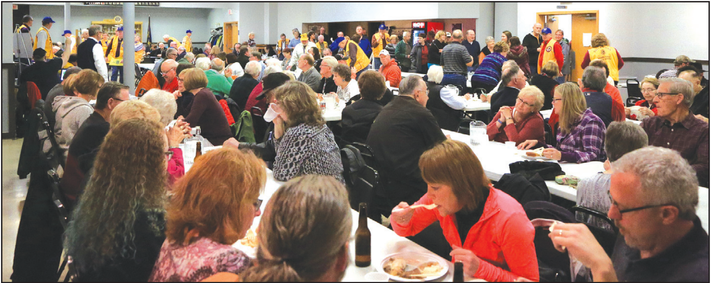
Full house for the Grand Forks Lions Fun Night.