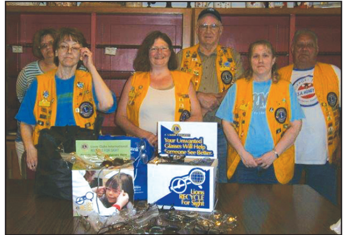
Our lions club has several used glasses drop off boxes set up all over New Rockford. This year for the convention we were able to send 200 pairs of glasses to be repurposed for those in need.