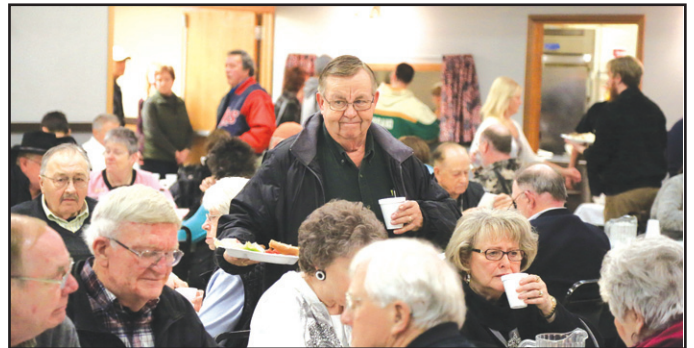
Where to sit?