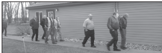
ZONE 5A held its Zone meeting at the 4H Camp in Washburn. They were given a tour of the newly renovated camp.