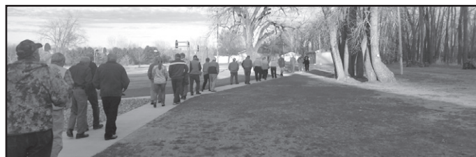
Zone 5A Lions can lead but at the 4H Camp they seemed to follow.