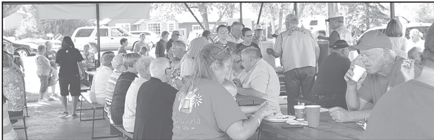
The picnic shelter in Stanley was filled for Stanley Lions Club's final summer barbecue.