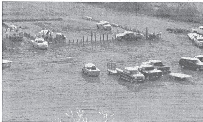
Volunteers repair the demolition derby arena.

with the financial support of the Lions Clubs of North Dakota, provide funding for grants approved by the Lions Foundation of North Dakota, Inc. For more