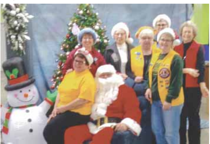
Pictured above are members of the Carrington Lions Club as they are "Santa's Helpers" during the clubs annual Santa Claus Day held on December 10. The Club had about 100 children visit "Santa" and talk to him and get their bag full of treats.