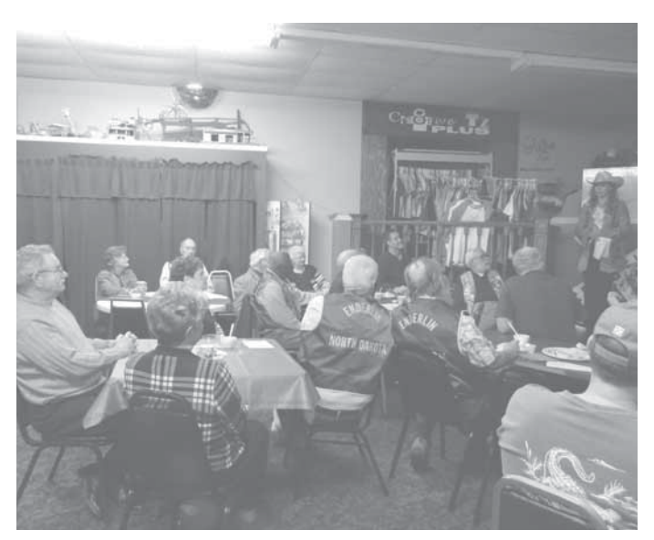
Enderlin Lions Club members had a special speaker at their Sweetheart's Banquet - Miss N.D. Rodeo.