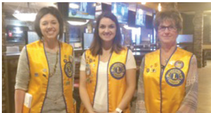
Minot Magic City Lions greeted the hungry public and invited us to come in and have breakfast!