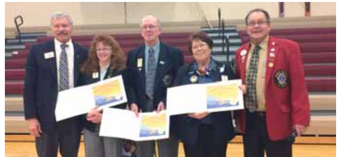
President's Appreciation Awards were presented.