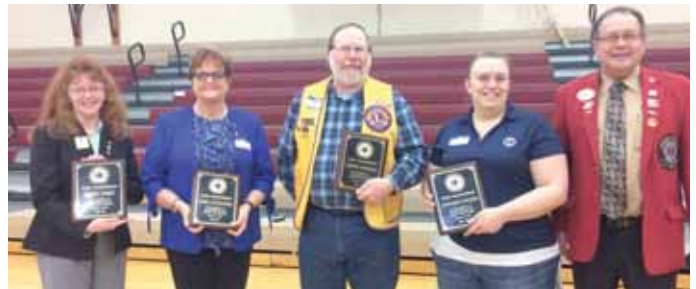
Zone Chairs receive plaques.