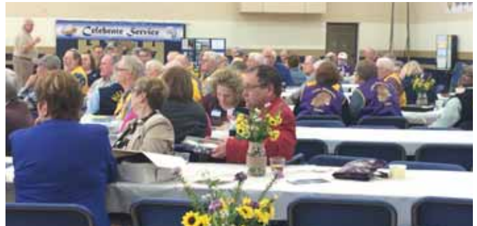
5NW Spring Rally well attended.