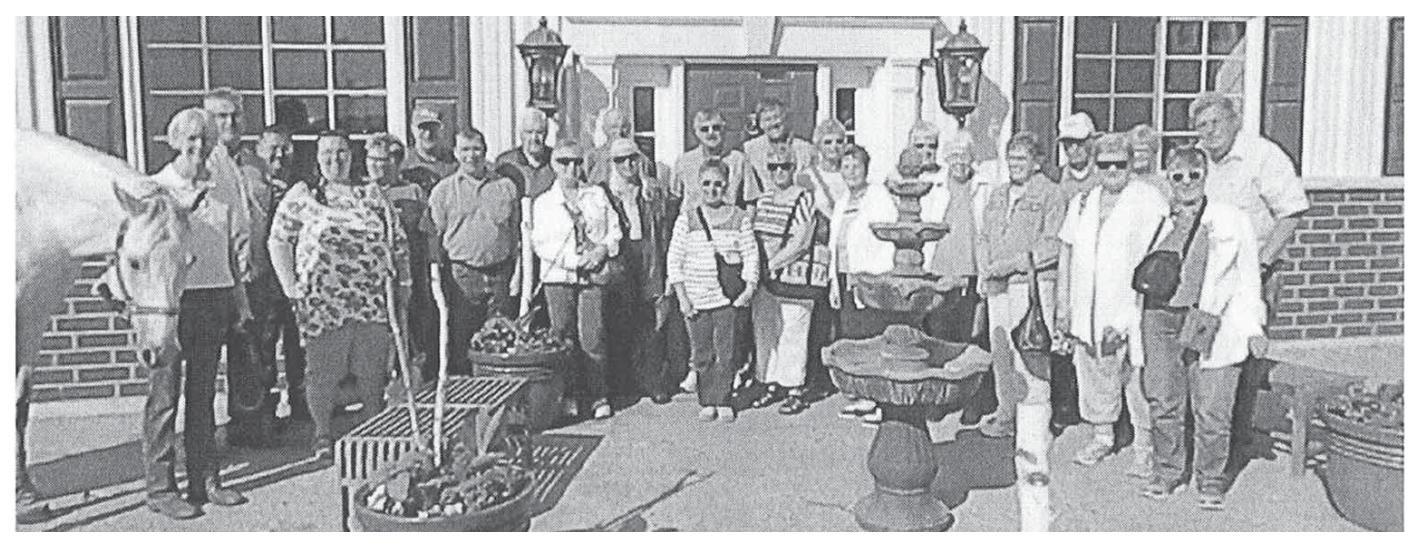
Enderlin Lions went on their annual summer road trip June 20. The trip included a shelf horse facility and Clay County Historical Center. Horses, a long ship and ala cart good food