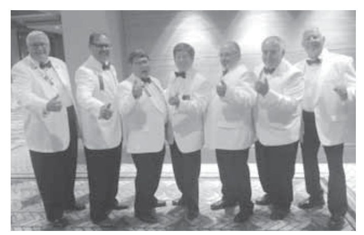
It's all "thumbs up" for DGEs and PID Robert at the Celebration Banquet!