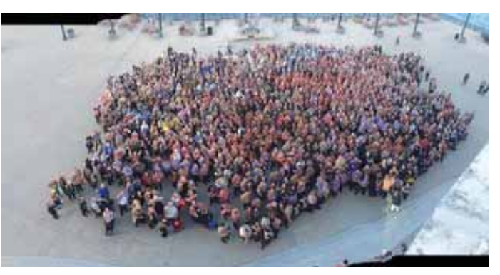
District Governors-Elect and Spouses on Navy Pier for group photo. Can you find your Governors?