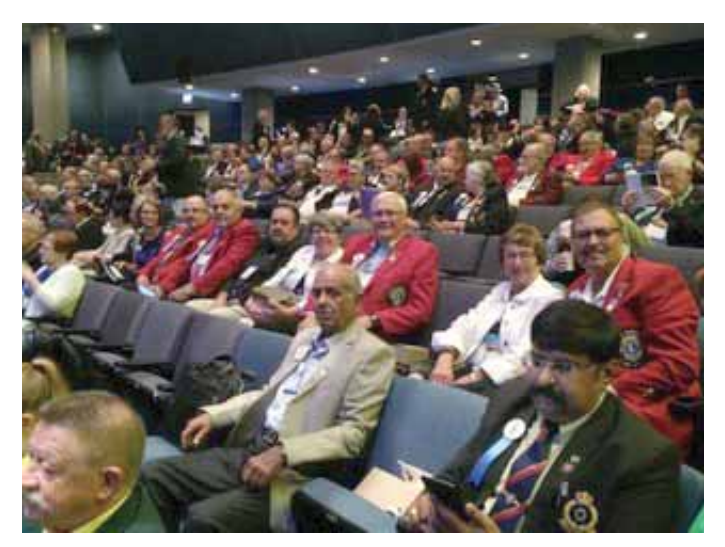
DGEs at the opening ceremony to begin their training.