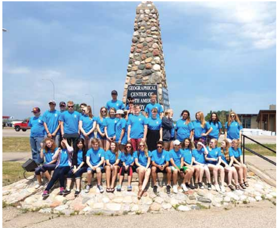
At Camp Bentley Drake ND, the MD5 hosted an international camp with kids from around the world. Pictured are the campers in Rugby ND at the Geographical Center of North America.

This was a successful Youth Exchange Camp that was made possible by the generous contributions from many clubs across the district. We thank all of you and have sent thank you cards to every club/person who contributed to this event.