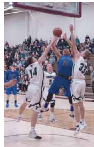
Action during the Four Winds/Minnewaukan “Indians” game vs the Thompson “Tommies”.

winners. The competition was outstanding!) Game 3 had the Crookston “Pirates” losing to the Park River/Fordville/Lankin “Aggies” by a score of 75-60. The final game of the day featured two perennial power teams in North Dakota Class “B” basketball, the Thompson “Tommies” and the Four Winds-Minnewaukan “Indians”. The “Tommies” came out on