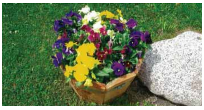
Emerado Arvilla Lions planted flowers for environmental project.