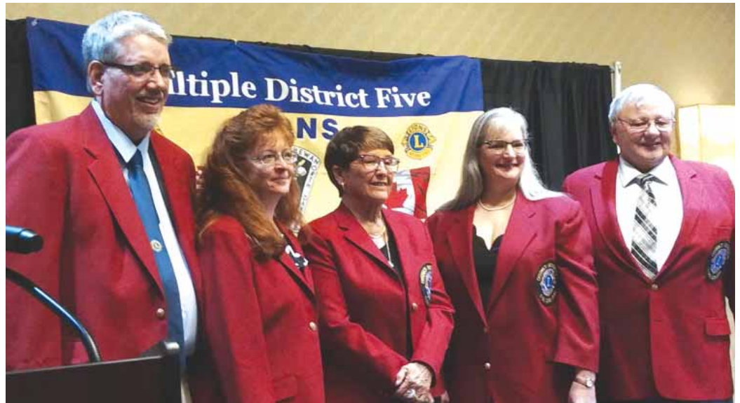
Five of the six new District Governors were also introduced.