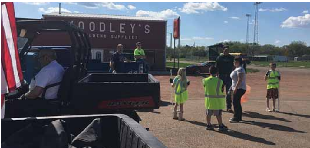
Cubs and Lions on foot ready to leave for US 85 pick-up