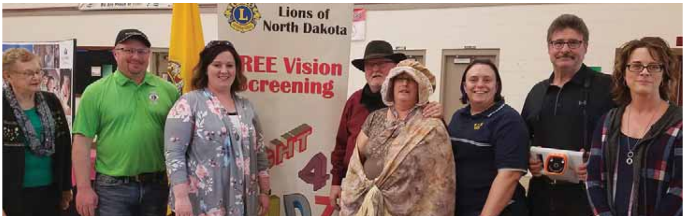
The Dickinson Lions and the Dickinson Noon Lions joined together to screen children at the Children's Health Event.