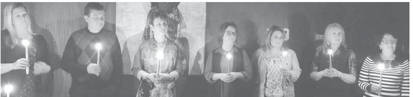
A candle light induction was done.