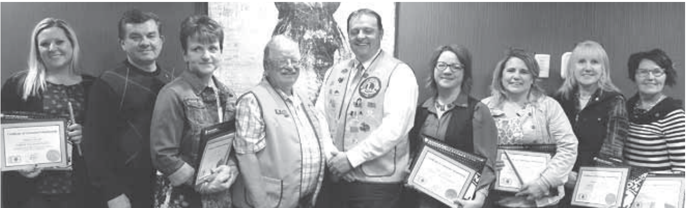
7 new members out of the 15 new members that just joined the Watford City Lions.