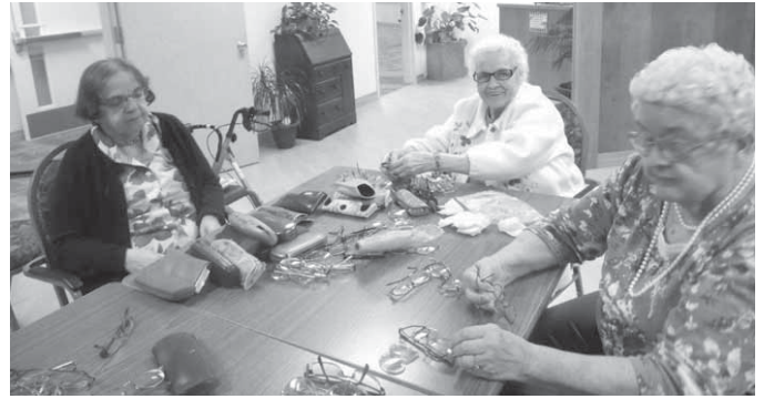
Here are some photos of the Rugby Lions Eyeglass collection project. The residents of the Haaland Home sort and count the glasses for us.