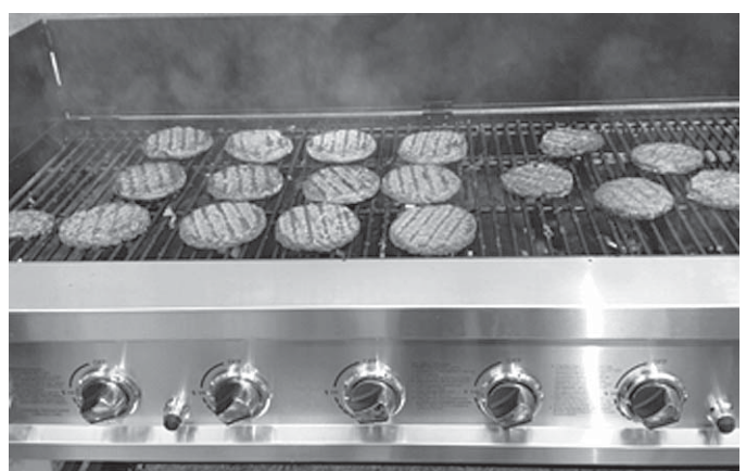
at 7 p.m. every Wednesday evening through August 15.