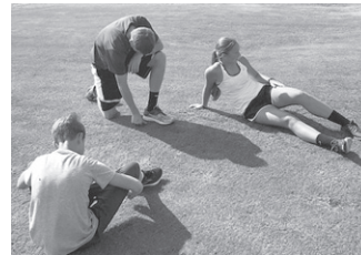
Three of the four team competitors compare times after the run

Lions. Along with the other two drives sponsored by the Rhame Ranchettes in February and October, the Lions drives are usually well attended and its UBS goals are passed early in the day! It goes without saying that the generosity of our local donor pool make the coordinator's job a lot easier. Some 54 units of "product" were gathered to make a very real difference in the lives of those patients in need. The next Bowman Lions community blood drive will happen shortly after Christmas.