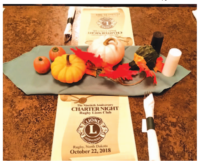
Program & table decor.