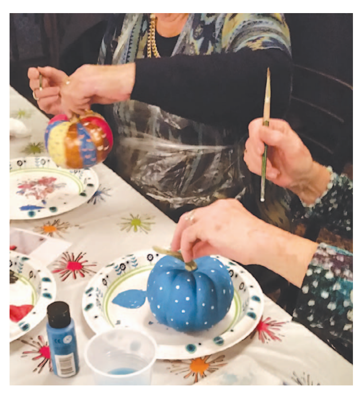
Artists at work.