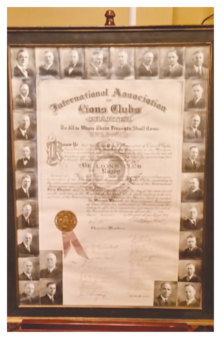
Original Charter and photos of founders.