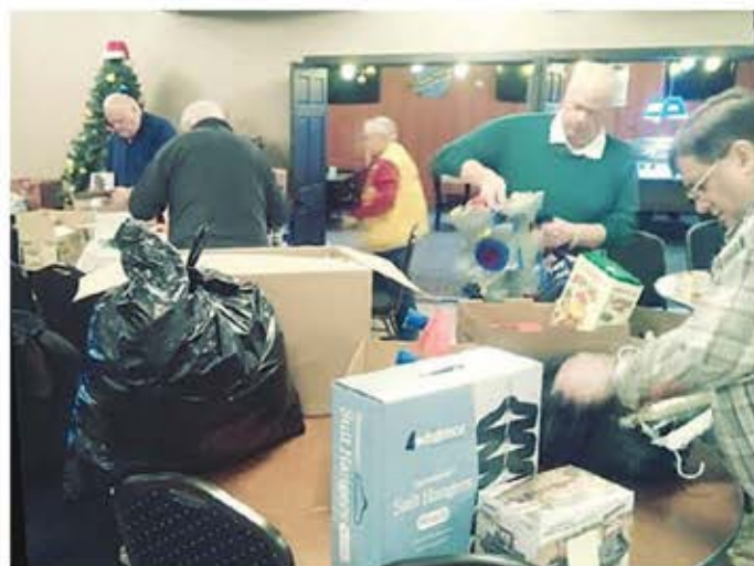
Opening bags of gifts brought from stores.

We check each family's gifts to see that every mem-