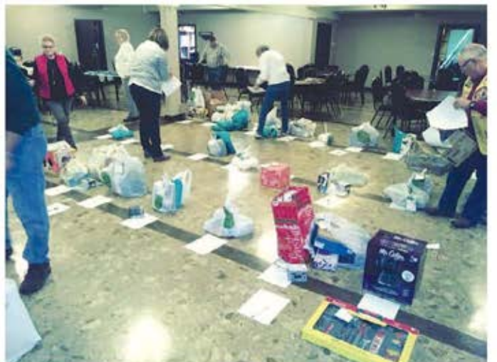
Checking to see that each person gets a gift.