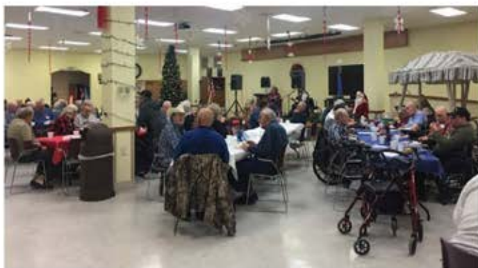
Williston veterans and their guests enjoy the luncheon served by the Korner Lions.

Williston Korner Lions assist with the Christmas for Veterans lunch held at the nursing home.