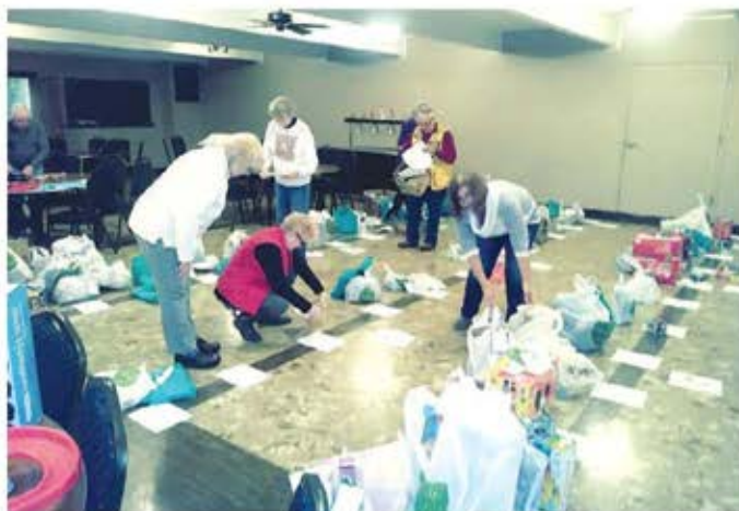
Placing gifts in family groups.