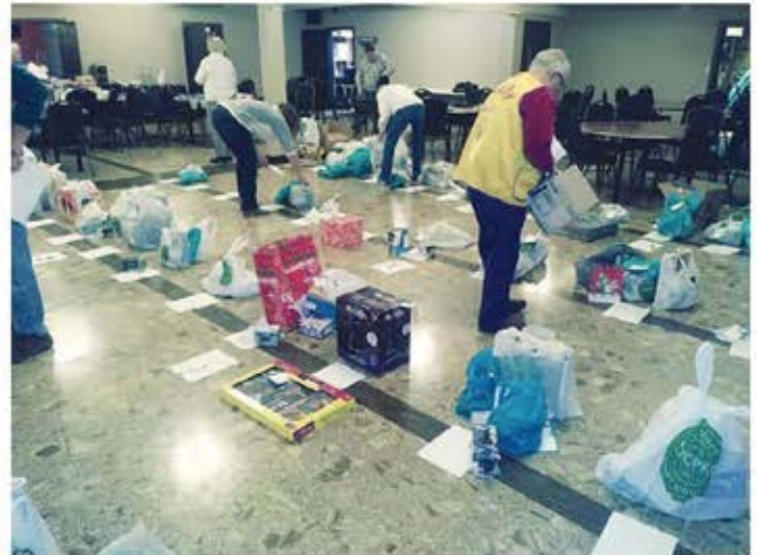
Opening bags of gifts brought from stores.

The Rugby Lions Club has provided this service to disadvantaged families since the 1980s.