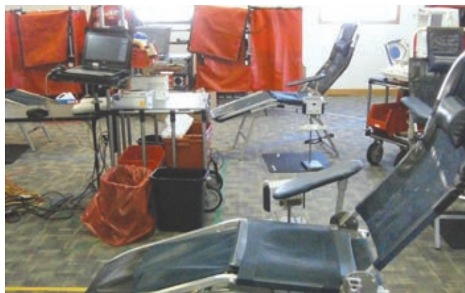
Room ready for donors.