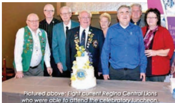
Pictured above: Eight current Regina Central Lions who were able to attend the celebratory luncheon.

Regina Central Lions Club celebrated their 90th Anniversary at on January 29th, 2019. There were 63 members and guests present to help celebrate the Club's milestone anniversary,