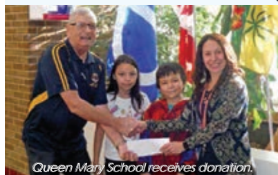
Queen Mary School receives donation.

The amount that is donated to the schools is the full amount of donations received from the participants of the Operation Red Nose Project sponsored by the Prince Albert Lions Club. Without the large