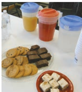
Drinks and snacks for donors.