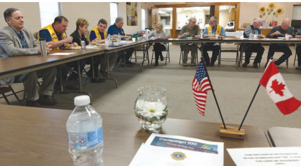
Lions enjoy the meal served at the final 1B Zone meeting for the year.