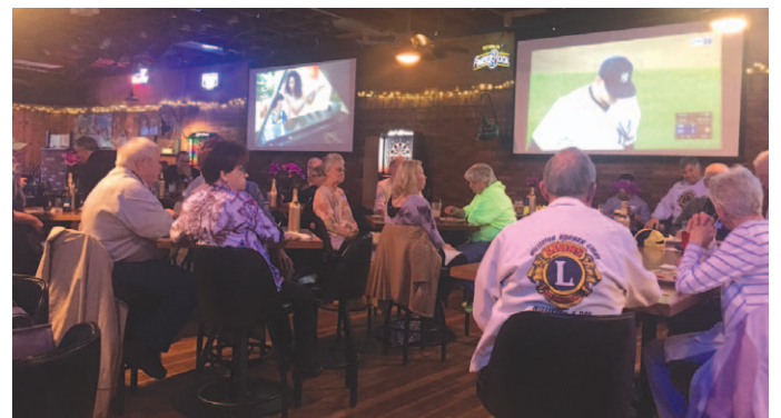
Williston Korner Lions share food and fellowship as they celebrate their 40th Anniversary.