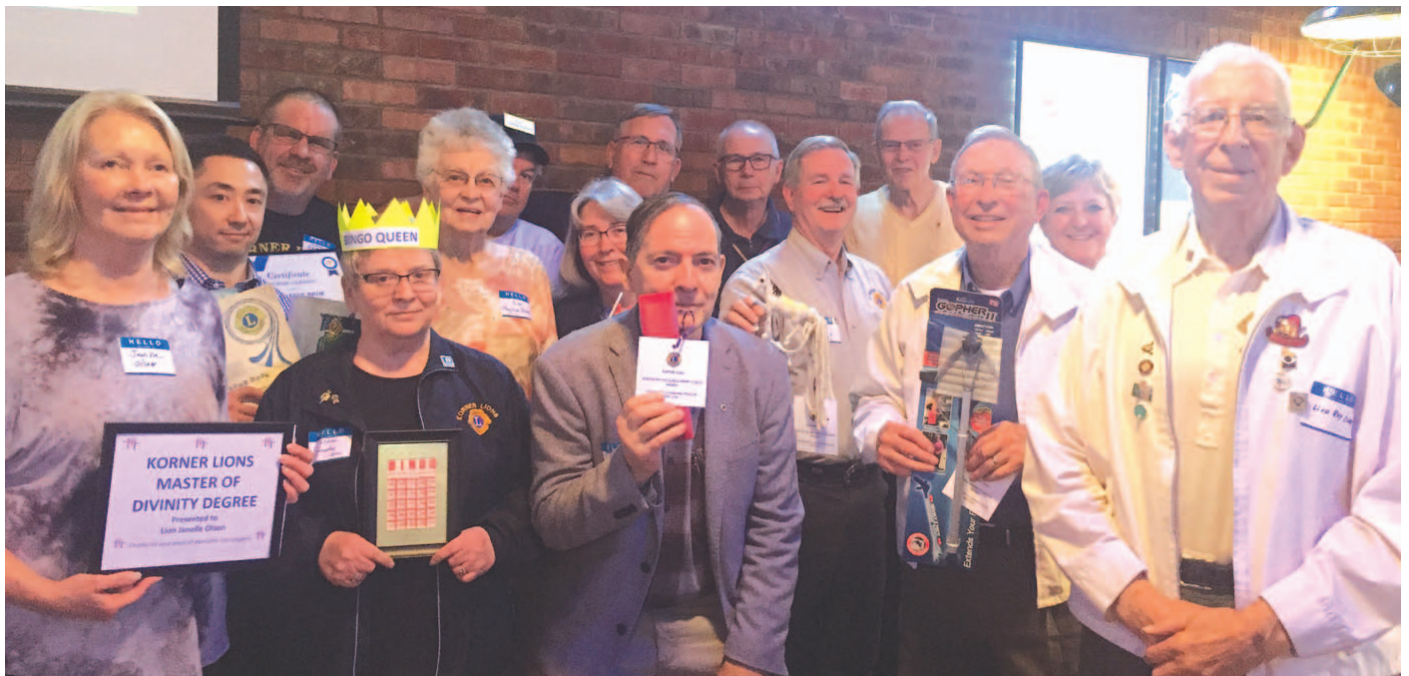
Williston Korner Lions celebrate their 40th Anniversary with special recognition awards presented.