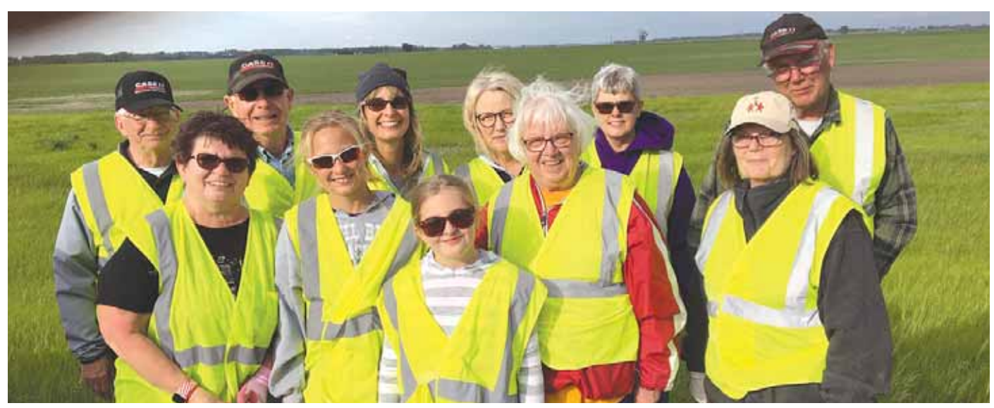
12 Carrington Lions and two youth volunteers gathered on June 11 to clean the ditches on 281 South of Carrington. After cleaning the two miles of ditches they enjoyed pizza at the Pizza Ranch.