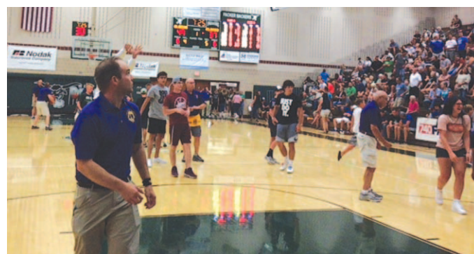
During halftime, people can come out to shoot free throws or 3 pointers for a chance to win an autographed basketball signed by all of the players and coaches.

The Capital City Lions Club and the Gateway Lions Club would lastly like to thank all of the 48 young student-athletes that played