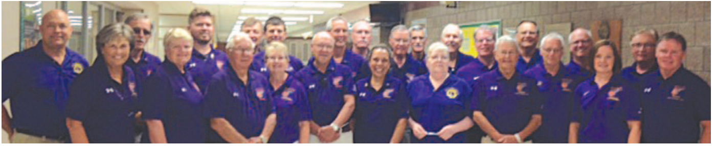
Members of the Gateway Lions Club as they prepare to do their duties for the evening.

in the games, without them the event would be nothing. We also want to compliment the athletes on how well they conducted themselves during their 5 days with the Lions Clubs. You represented yourselves very well as well as your school, communities, schools and parents. GREAT JOB!!!! We also want to thank the 8 coaches that took time away from their busy schedules to help make the games a success. THANKS!!!!