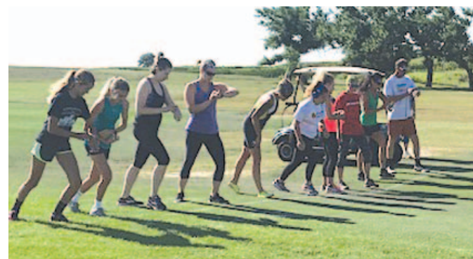
On your mark, get set, GO!