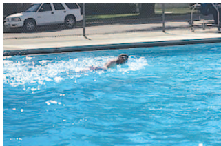
And they're off!