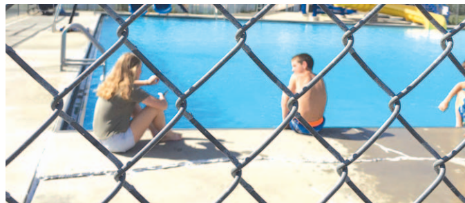
Help and encouragement from a team mate, even if it IS your sister!