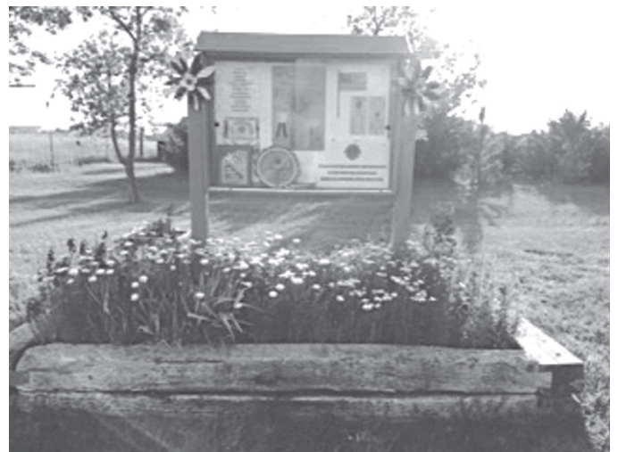
Our Memorial to our departed Lions.