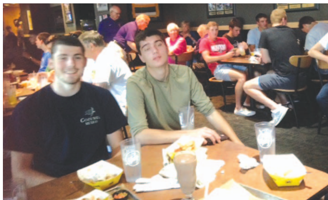
Pictured above are some of the boys basketball players as they enjoyed a meal from Buffalo Wild Wings in Fargo.