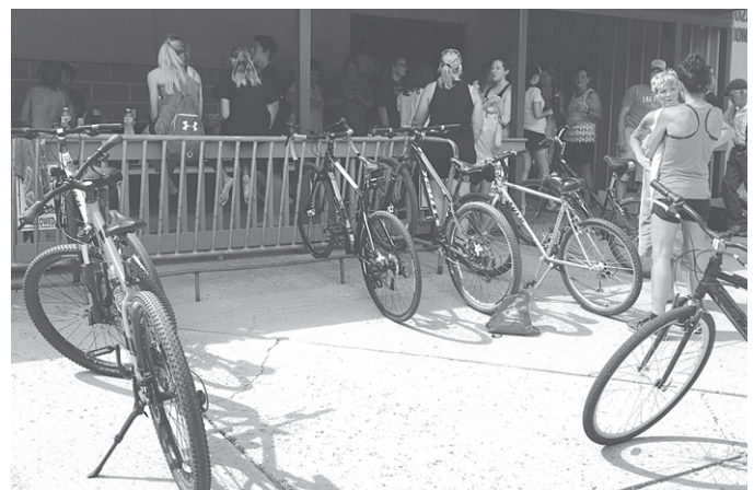
Contestants get their light breakfast after the event.