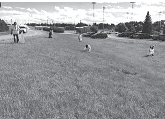
Our cub scouts spread out to cover the ditch!