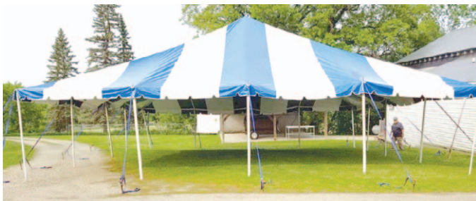
The Enderlin Lions show off their Lions tent that was purchased with the help of a Lions Foundation of North Dakota grant.