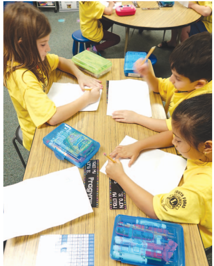
Pictured here are students wearing the specially designed t-shirts provided by the South Forks Lions.