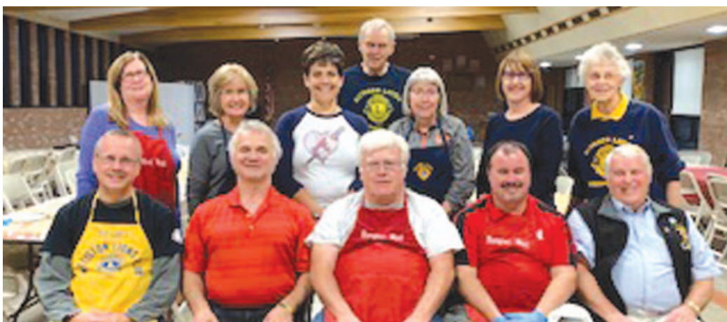
Williston Korner and Williston Lions Clubs join forces to serve Banquet West which is a weekly community meal for anyone who wishes to attend.

Reminder: ND Lion DEADLINE is the 7th of the month!