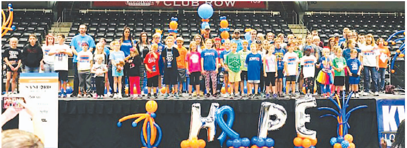
Pictured above are some of the youth and adults that took part in the JDRF Walk at Scheels Arena on September 14.