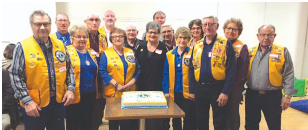
Napoleon Lions members attending the 90th anniversary celebration.