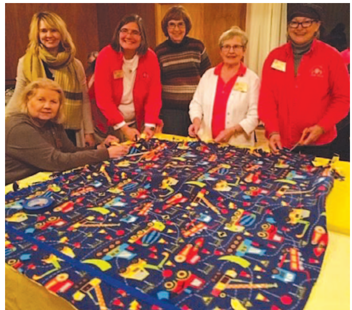
The Prairie Rose Lions Club of Bismarck gathered to create 8 no-sew fleece blankets. These blankets will be donated to the Ronald McDonald House in Bismarck where they will be given to children with cancer. This Service Project turned into a really fun activity for all of the Club Members!