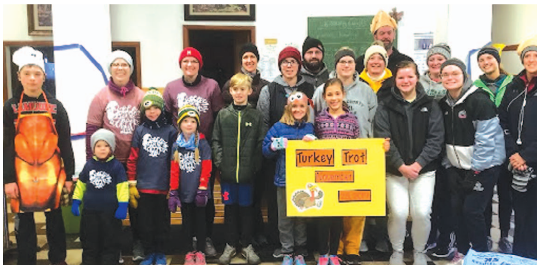
Turkey Trot runners and walkers pre-race.