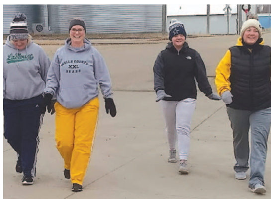
Women's 5K walkers heading to the finish line.