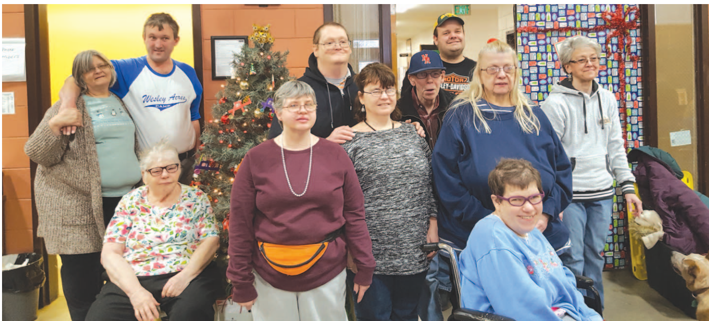
New Rockford Lions members played Santa to the clients of Fourth Corporation in New Rockford this week bringing everyone a little Christmas joy and a gift to open.