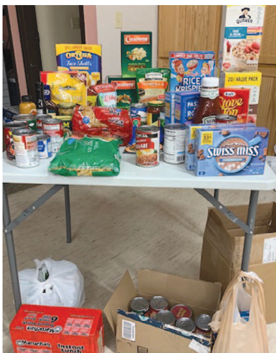
The Korner Lions collected nonperishable food items at the annual Christmas party that were donated to the Gloria Dei Church food pantry.