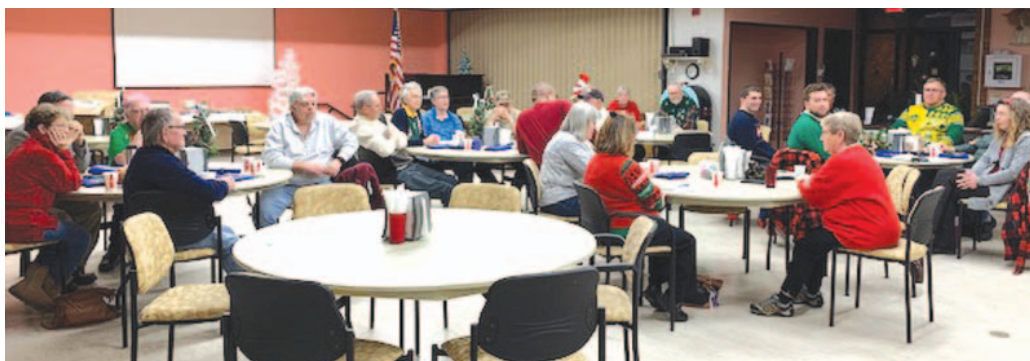
The Korner Lions celebrate at a Christmas party with games, singing Christmas carols, awards and a unique Christmas sweater contest.