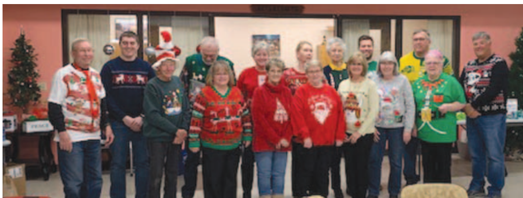
Korner Lions show off their Christmas sweaters.