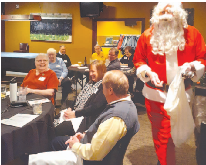
"Santa" spreading his joy at the Gateway Lions Club mid-year social.