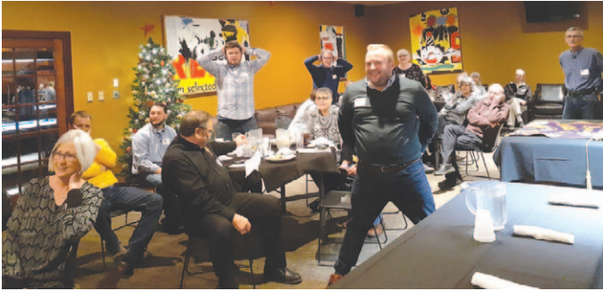
Gateway Lions Club member enjoying a game of "Heads" or "Tails" at their mid-year social.