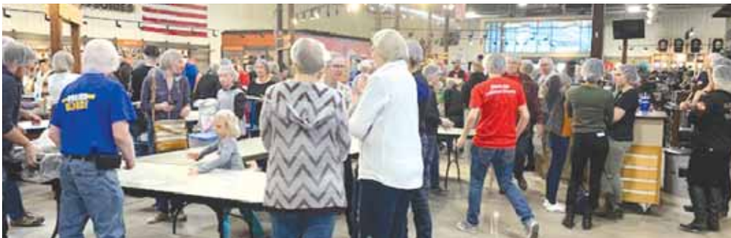
The Feed My Starving Children event was held at the Williston Harley Davidson store. Shown are some of the many volunteers who assisted over the 3 days.