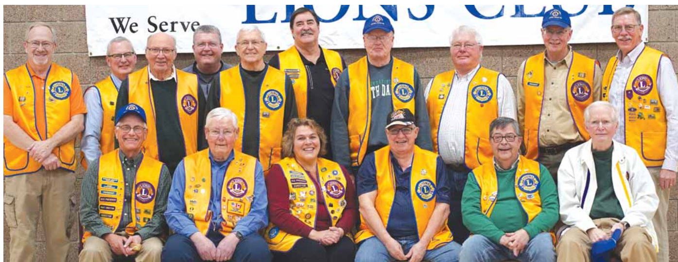
Many of the South Forks Lions at the Dick Compton South Forks Lions Shootout