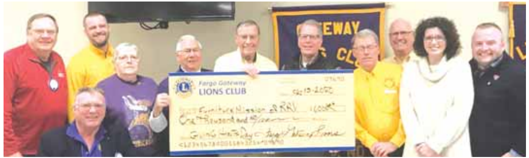
Pictured above are some members of the Gateway Lions Club of Fargo as they are shown presenting Furniture Mission of the Red River Valley a check for $1,000.