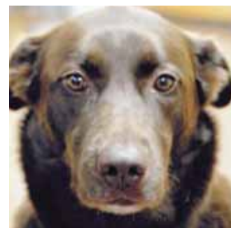
Scooby, awaiting a companion service dog at Luther Memorial Home, recently turned 13 years old.