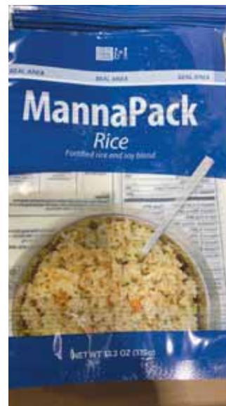
11,736 of the MannaPack rice packages were filled with rice, soy, vegetables and vitamins in the 3 day event. One package contains 6 meals so that is 70,416 meals..