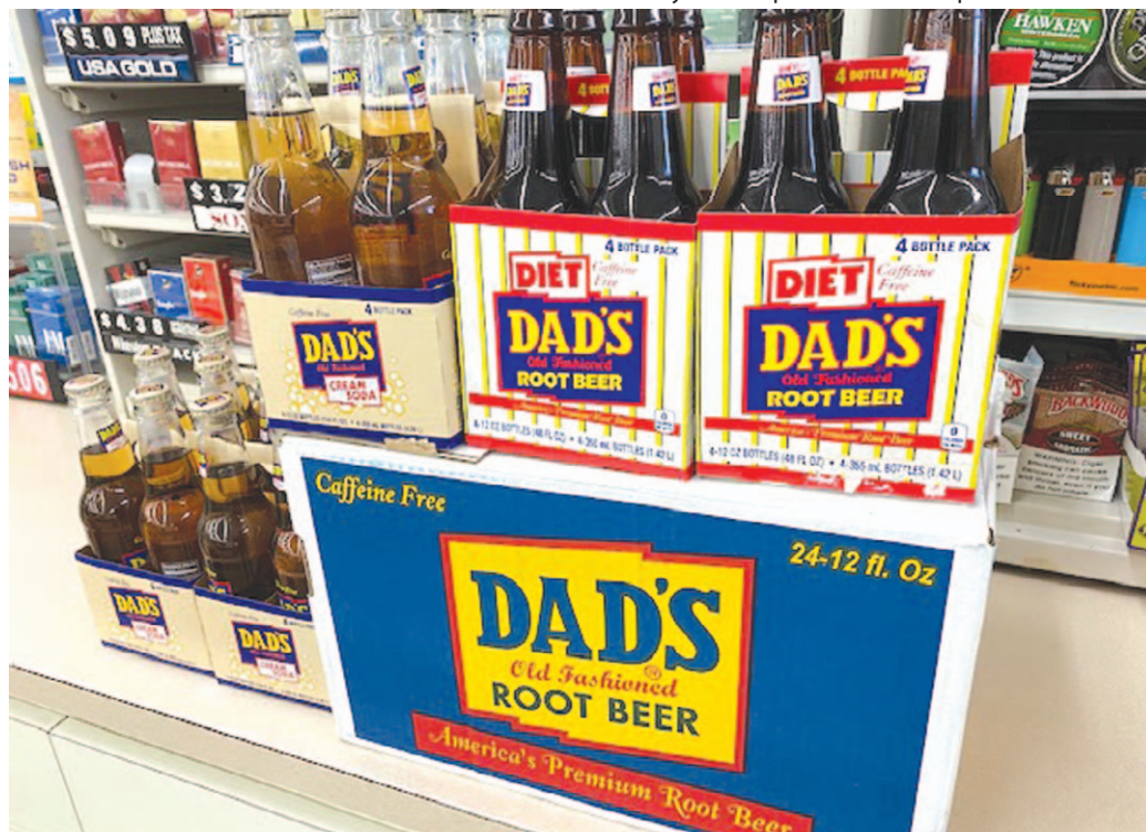
Dad's root beer display.