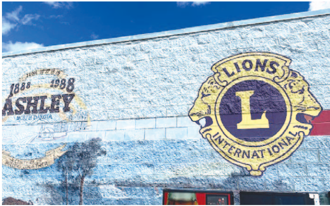
Lions logo on the Ashley Super Valu store.

Isn't the Lions Logo on the side of his grocery store MA-JESTIC!??