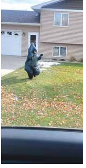
indoors. Thank you, Davenport Lions for your BOO-tiful service in delivering JOY and HAPPINESS for one night into the lives of 120 little children.