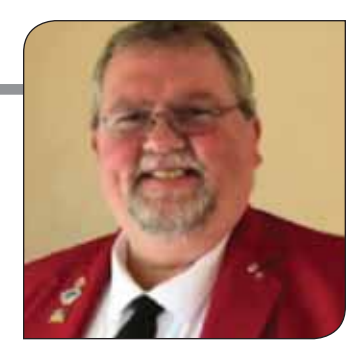
April 10th, 2021. Until next time and remember "We Serve."

That means a total of just 42 Lions. There are clubs that have more members than that. Most of them are active members. They just haven't submitted an application for the award that recognizes what they have done.