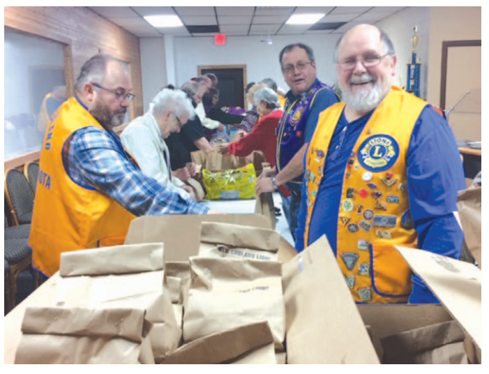
New England Lions packing candy bags

The New England Lions club has another project. Several years ago, at the New England Memorial Hall grounds on Main Street, a large beautiful evergreen