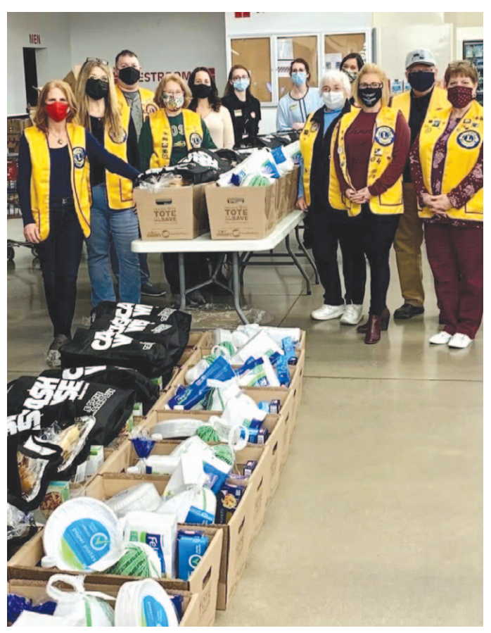
Annual Thanksgiving basket shopping on November 24th increased this year to help 21 families in need in the Minot area.