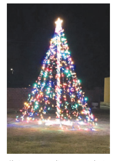
Christmas tree lit up at night in New England

With the new challenges of COVID-19 in the area, the school is not having a Christmas program this year. Our club has decided to do what we have always done by purchasing the goodies, packing the bags of candy and delivering the candy bags to our school. The faculty will hand the candy to the students, without Santa Claus. We will