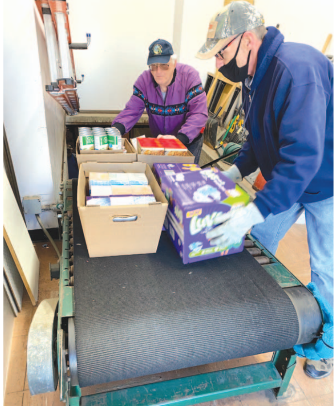
Lions unload food at Aid Inc.