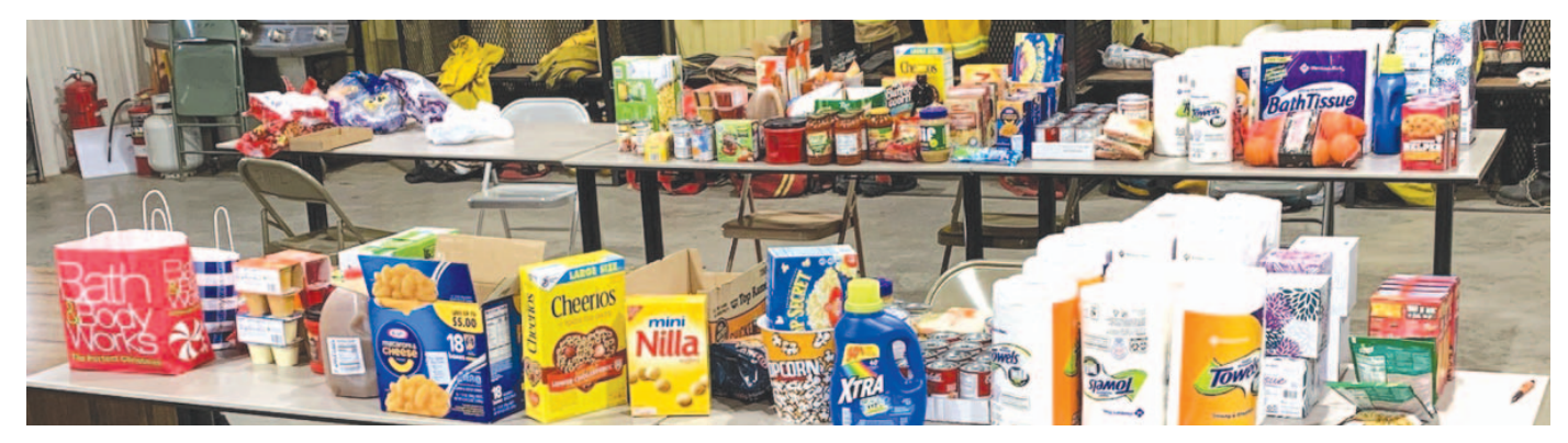
Food items purchased to be donated to various pantries.

The South Heart Lions Club purchased food for local families and food pantries. The South Heart Lions heard about the needs in the community and decided to purchase $100 worth of food items for a couple of families to help out over the holidays. Donations were received from the club members that assisted with the cost of the items. The total raised was $740 for the service projects.