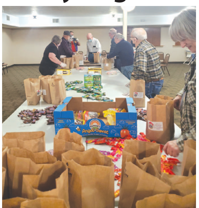
New England Lions filling candy bags, while observing mask and distancing guidelines.

The New England Lions typically bag candy for Santa to give children after the New England Public School Christmas Concert. Several hundred children have the opportunity to sit on Santa's lap, have a picture taken with Santa, and get their bag of candy and peanuts.