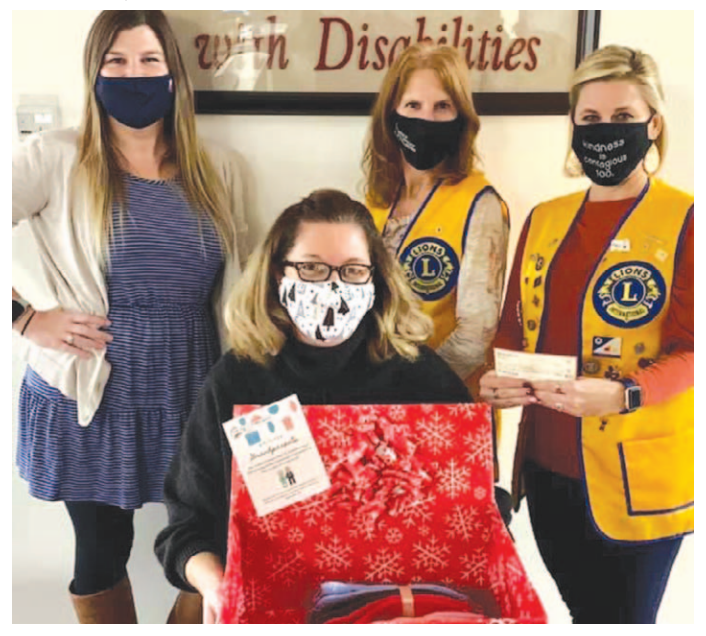
$500 donation to Gifts for Grandparents through ND Center for Persons with Disabilities.