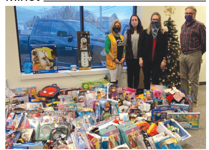
$5000 donation for gifts for Minot Area Homeless Coalition and Community Action