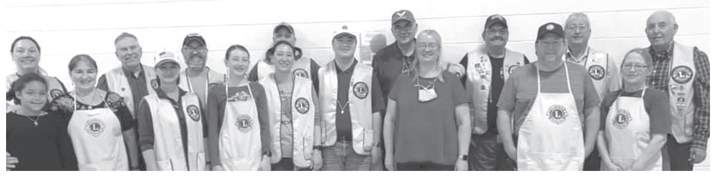
Glenburn Lions hosted a Pancake Breakfast benefit for the Glenburn Fire Department that had to a fire in their building in March. $6,500 in donations were raised to assist with replacement costs of firefighting equipment and renovation of the facility.