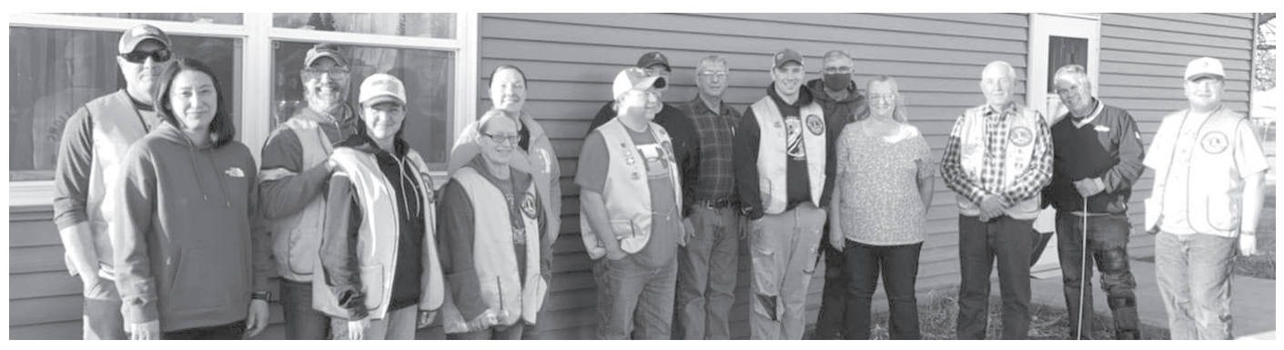
Glenburn Lions Stay Busy Serving during April Glenburn Lions took to the ditches on 21 April 2021 for the annual spring ditch clean-up. Pride for our sevice is a common element of our service.