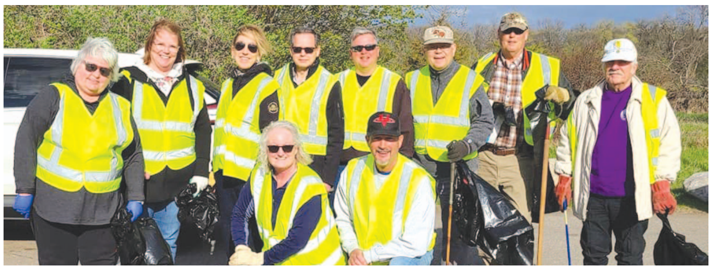
The Fargo Lions Club and their families cleaned ditches along South University Drive and tidied up the Lions Conservancy Park. We Serve in wind and cold -- next time you are in the area, visit the Lions Conservancy Park. It is filled with native grasses, wildlife and birds. It is a lovely little spot on a bow in the Red River.