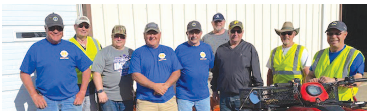
The Harvey Lions Club did their semi-annual ditch cleaning, May17th on the 4 miles south of Harvey on Highway 3. We collected 20 bags of garbage making North Dakota cleaner and greener.