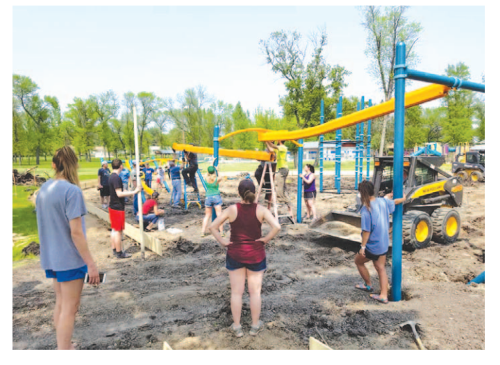
The community build project installing new play equipment.

Phase III: A Community Swimming Pool is in the initial planning stages managed by the LaMoure Park Board and supported by Lions. Phase IV will create designated parking areas. This multipronged effort involves Lions, Park Board and the City of LaMoure. New parking areas are well on their way to be completed in 2021