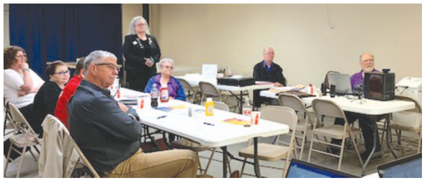
District 5NW Cabinet team members are engaged in conversation.