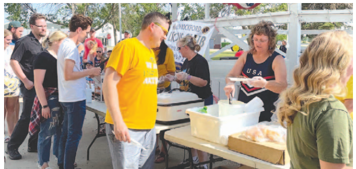
New Rockford Lions served a brisket dinner with all the fixin's on July 3rd during the city's annual 4th of July celebration. Approximately 200 people showed up for the event with all money raised going to the New Rockford bowling alley restoration project.