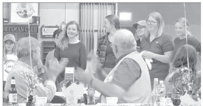
The Medina Cafe served a delicious steak dinner.