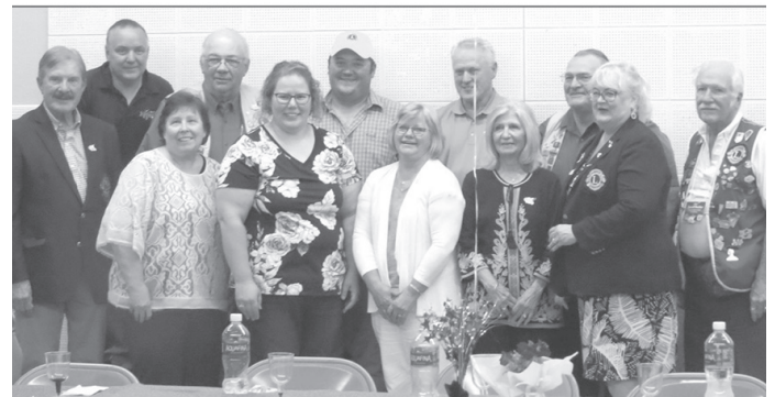
Medina Lions Club members and special guests.