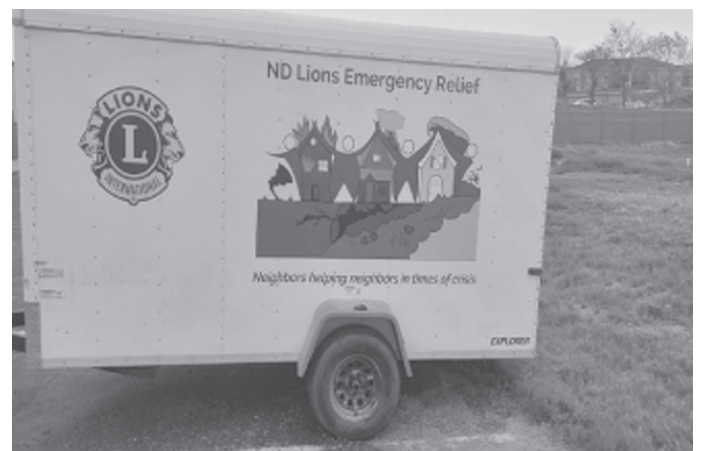
Picture is a trailer that was donated to the ND Lions Emergency Relief by a victim who received assistance due to a fire.

Moving forward the goal for the Mandan Fire Relief Team is to have the ability to be onsite at disasters when needed.