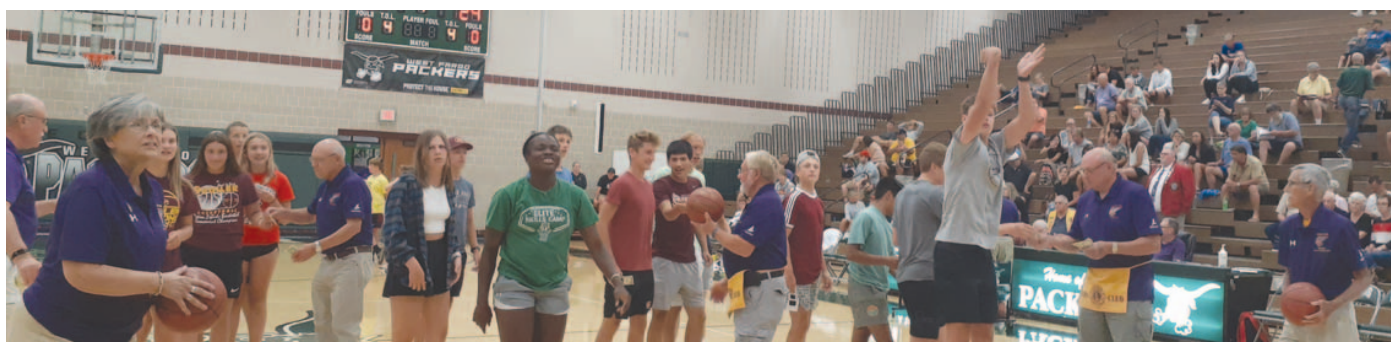
Shoot around at half-time of the Lions All-Star Basketball Games. The winner won an autographed basketball.