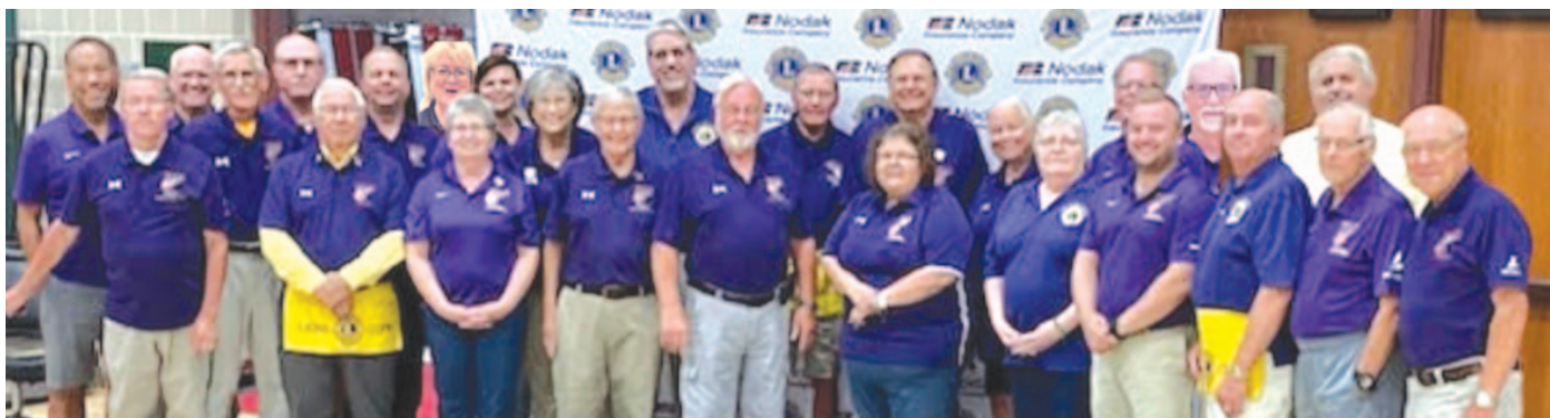
Members of the Gateway Lions Club as they prepare for their "JOBS" for the Lions All-Star Basketball Games.