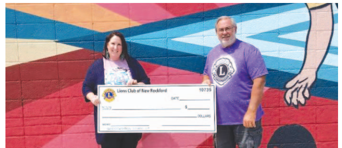
A total of $3,000 was raised towards the project. An additional $10,000.00 was given to the restoration project from the New Rockford Lions Club for a total of $13,000!!