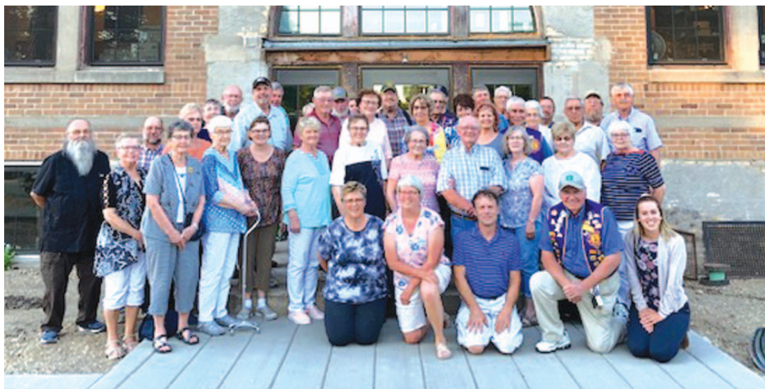
Following the tour of the schoolhouse, everyone stepped outside and lined up for a group picture.