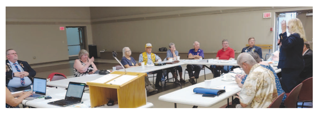
The first Cabinet Meeting for District 5NE.