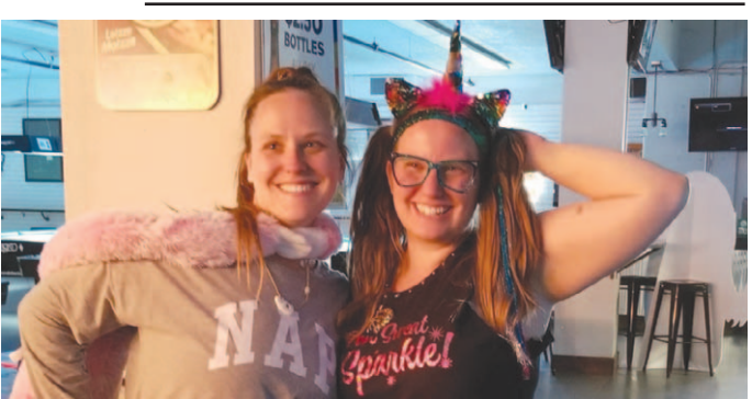
The Minot Lions Club held their annual TrySlothalon on August 21st! A fun time was had by all!