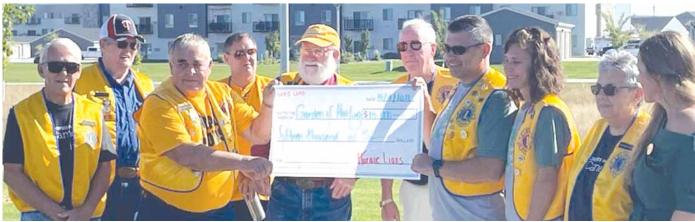
Members of the club are shown presenting a check for $15,000.00 to founders of the garden.