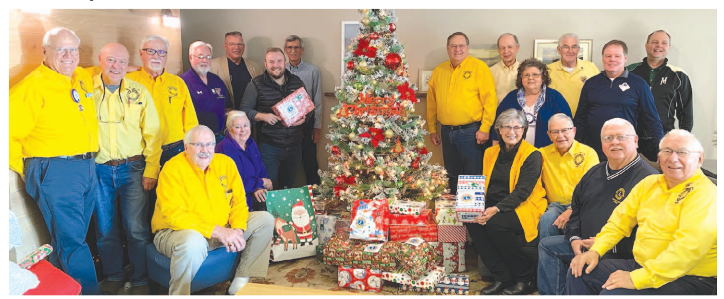
Pictured above are members of the Gateway Lions Club as they sit around the Christmas tree with all of the presents that the members brought for the "CHRISTMAS BOXES" project. The club gave 36 boxes to the Emergency Food Pantry to give to children ages 2-14 that are less fortunate