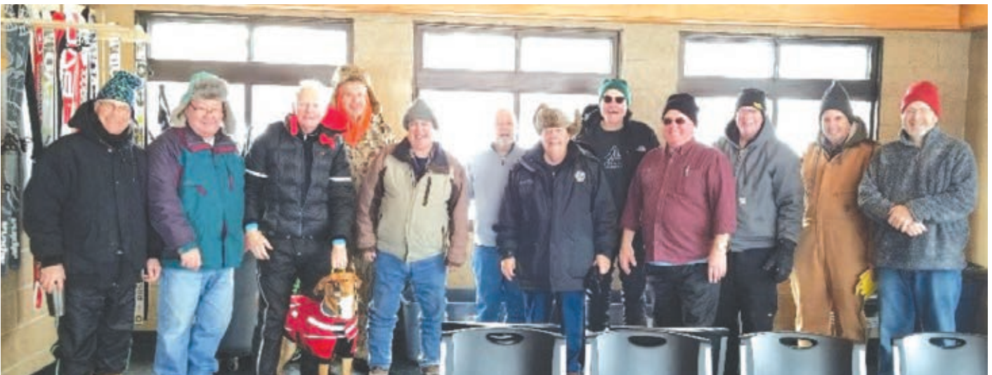
South Forks Lions work crew (with someone's infamous dog) take a break on a very cold day of removing displays from another successful Christmas in the Park event.