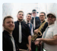
• The Bromantics - Twist the Night Away!