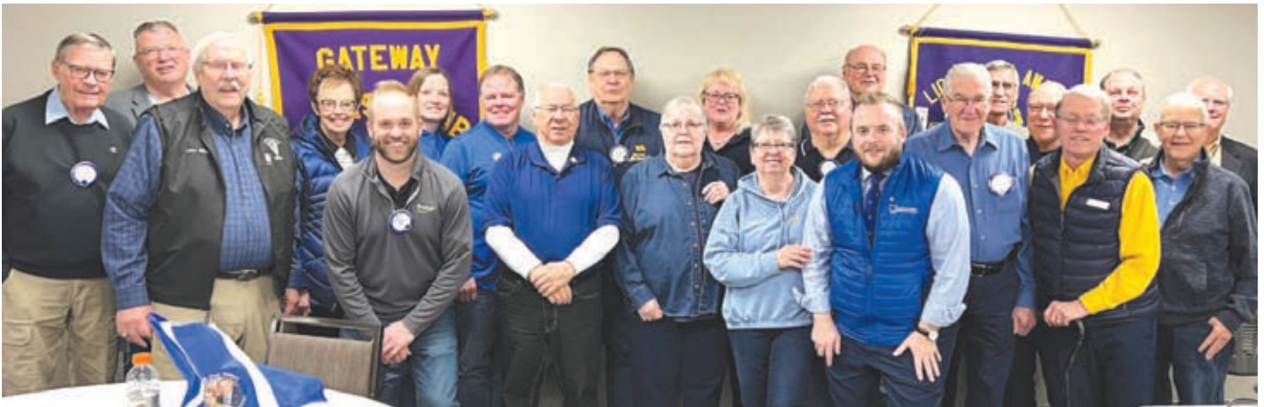
Gateway Lions, wearing blue attire, are pictured after their March 4th meeting. “WEAR BLUE DAY” is a day to spread awareness of colon cancer.