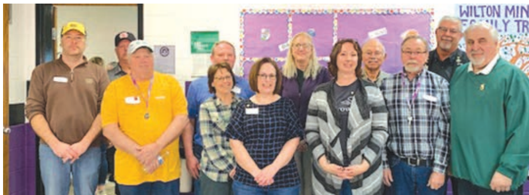
The Wilton Lions Club did an awesome job of hosting the 5NW Spring Rally. Thank you Wilton Lions.