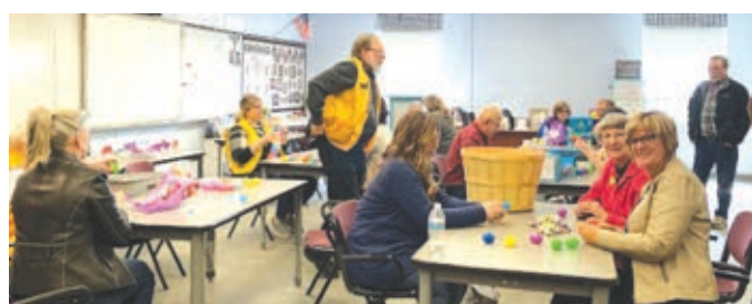
5NW Lions work on a service project filling 1200 eggs for the Wilton community egg hunt.