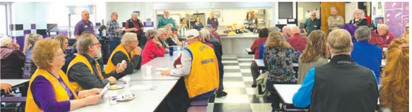
Lions enjoy breakfast provided by the Wilton Lions prior to the sessions.