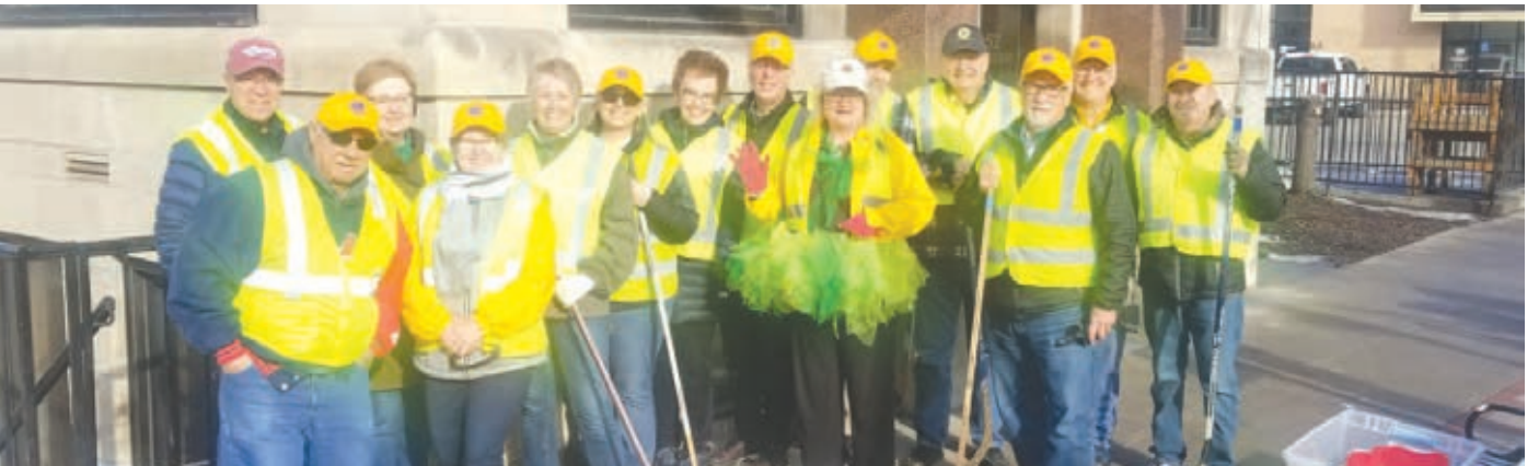
Members of the Gateway Lions Club as they begin to patrol the Streets for the St. Pats Day parade in down town Fargo on Saturday, March 19th. Notice some members holding hockey sticks. They are to "bring back" the candy from the middle of the street to the kids.