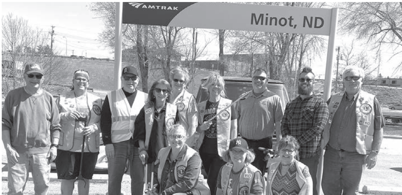
Minot City Cleanup May 6th