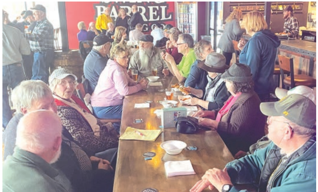
Enderlin, Sheldon, and Gateway Lions enjoy evening at the Swing Barrel Brewery in Moorhead, MN