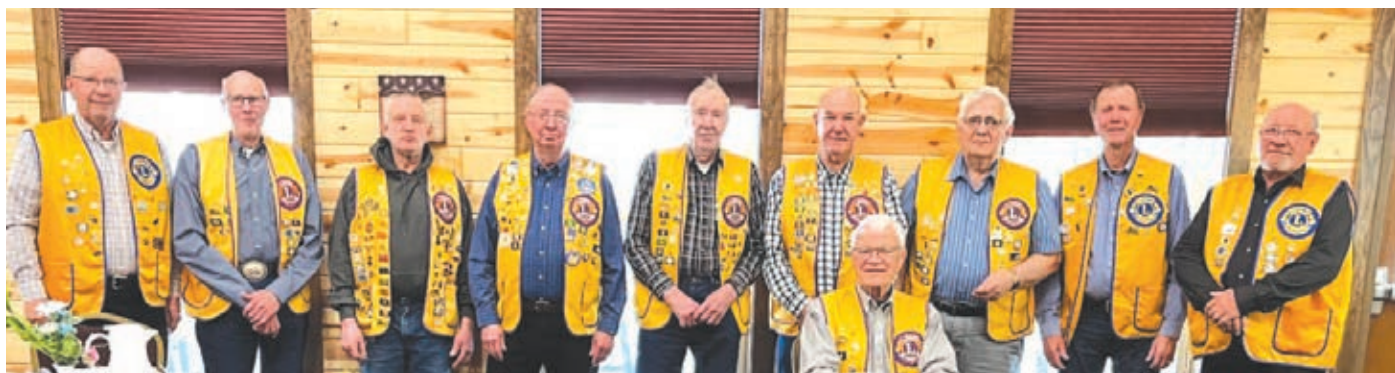
Several members were recognized by the Stanley Lions club for perfect attendance.