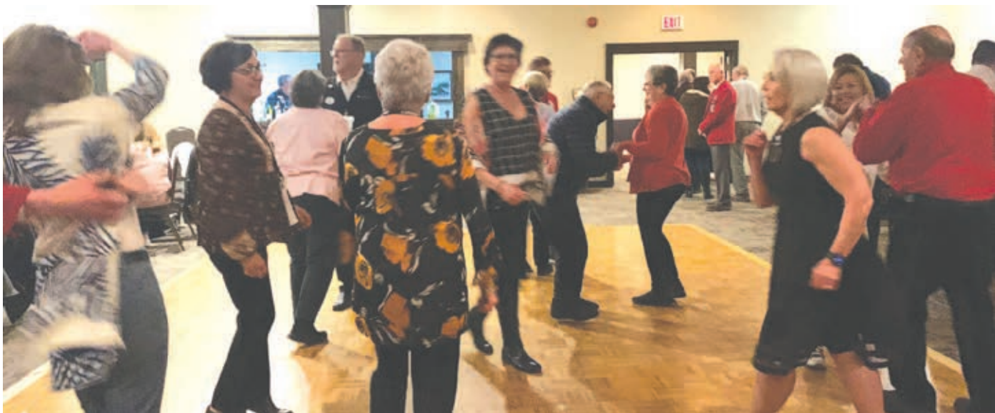
Lions dance to the Bromantics