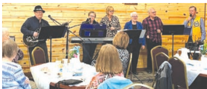
Stanley Lions held their Ladies night on May 9th with a great meal and wonderful entertainment by the Replacements.

ND Lion deadline is the 7th of the month!