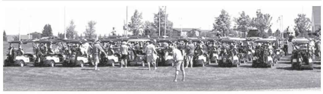
Golfers ready for the start.