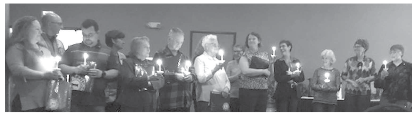
10 of the 12 new members being installed on June 6th at the Installation & Awards Banquet