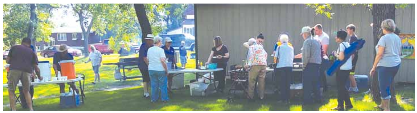
Rugby Lions Music in the Park every Wednesday in the summer with free ice cream cups to all.