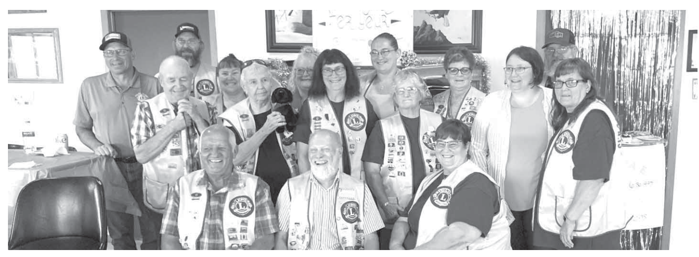
Scranton Lions celebrate their 25th anniversary.