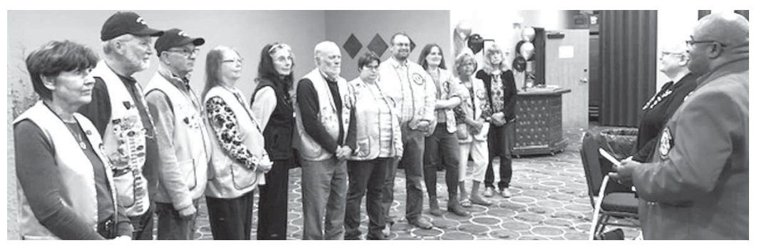
The 2022 – 2023 Bowman Lions Club officers were installed on June 6th.

At our Awards and Installation Banquet we welcomed 12 new members into our Lions family. We reflected on the positive, successes of the