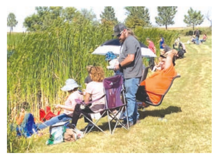
12 THE ND LIONS | October 2022