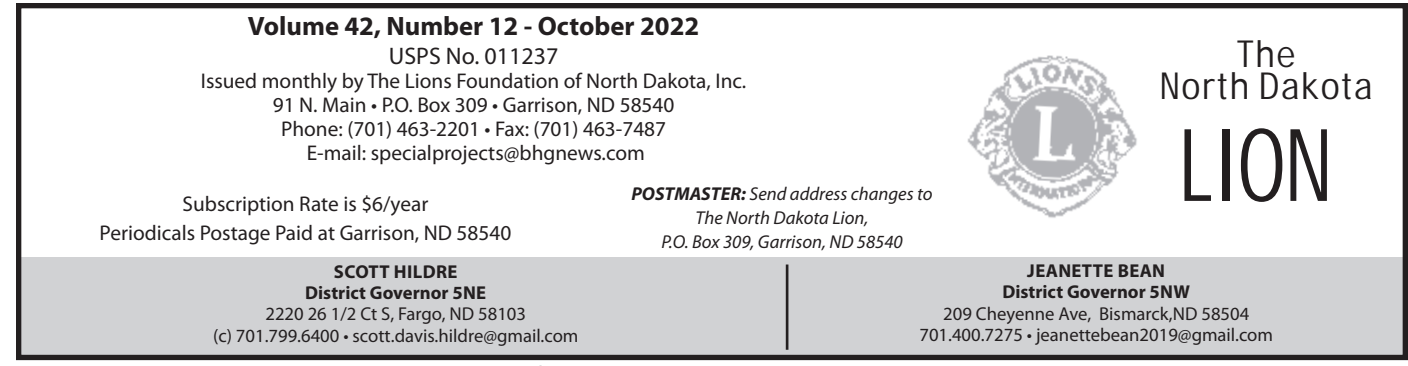
2 THE ND LIONS | October 2022